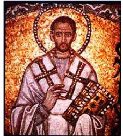
John Chrysostom c. 347—407

In our celebration of Easter, we are given the chance to experience how through Jesus’ death and resurrection new life springs out of hopelessness and despair. Throughout the ages, Christians have come to hear their own stories told within the Passion narrative. For within the cycle of Holy Week and Easter, the most tragic and most hopeful statements in human life are spoken.