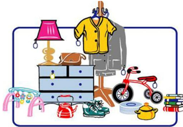
Emmanuel Annual Rummage Sale

All Proceeds benefit our Mission Trips for Adults and Youth This is an important fund-raiser for ALL of our Mission Trips